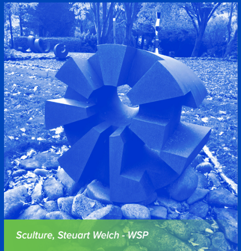
Sculture, Steuart Welch - WSP