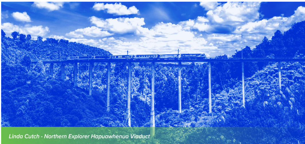
Linda Cutch - Northern Explorer Hapuawhenua Viaduct

Depart 10am. Return approx 2pm. Adult $18 | Child $10