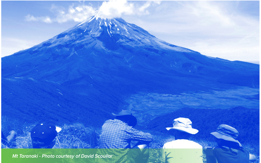
Mt Taranaki

and Discover Whanganui on Facebook for all your information about Whanganui.